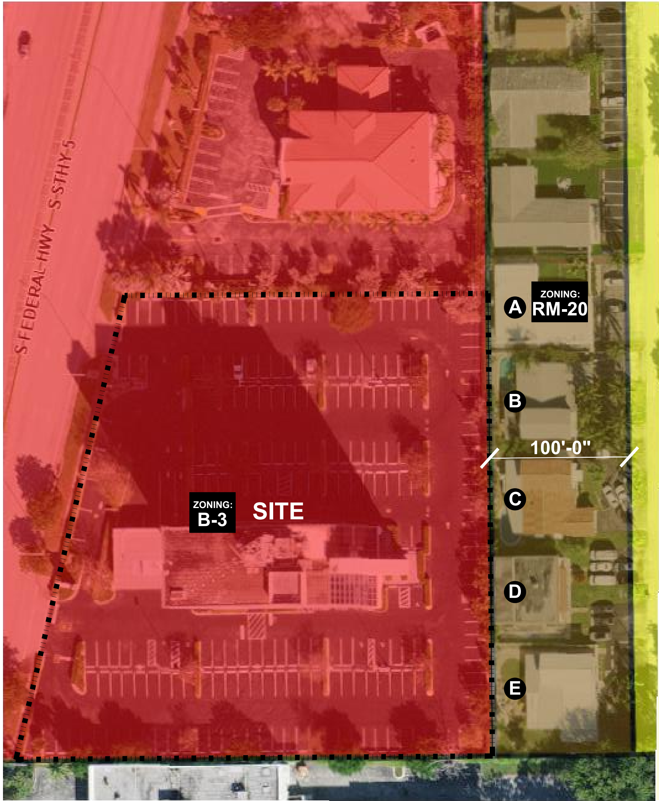
01 ADJACENT ZONING DIAGRAM A-004A SCALE: NTS